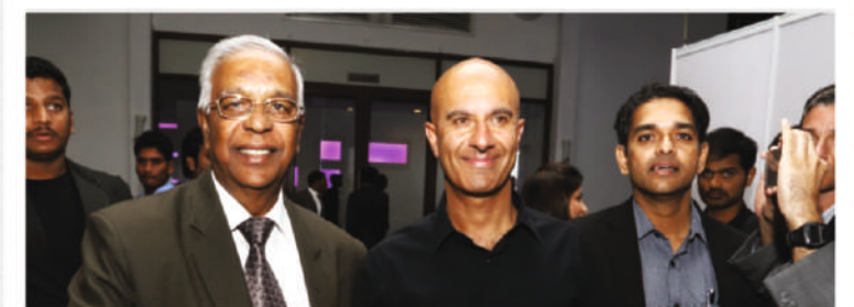
With Mr. Robin Sharma, leadership expert and bestselling Canadian Author