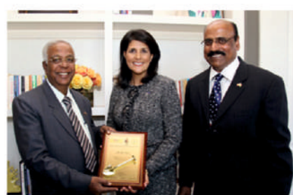
Receiving Mahatma Gandhi Memorial Award from Hon'ble Nikki Randhawa Haley, Governor of South Carolina, USA