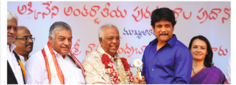
Receiving the Eminent Educationist Award from Shri Akkineni Nagarjuna