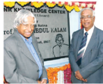
With the former President of India, His Excellency, Bharat Ratna Prof. A.P.J. Abdul Kalam