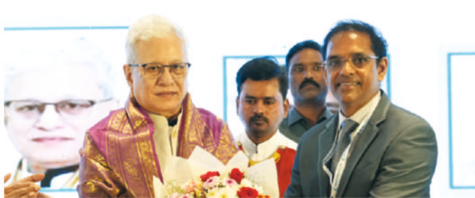
MNR University hosted the National Conference on "India@2047" with Hon'ble Governor of Telangana Shri Jishnu Dev Varma as Chief Guest