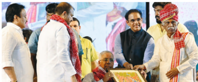
Felicitation by Shri Bandaru Dattatreya, Former Governor of Haryana during the Dussehra Aalay-Balay Program