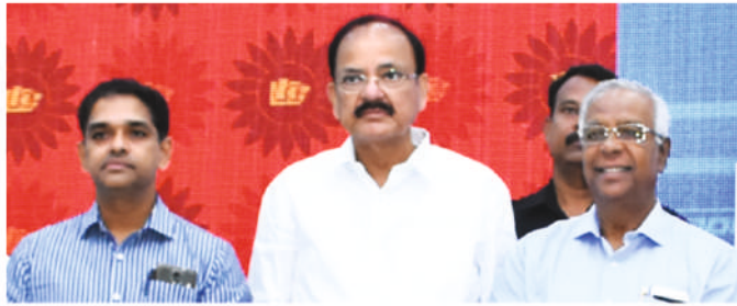
Free Medical Camp inaugural by Hon'ble Cabinet Minister, Sri Venkaiah Naidu