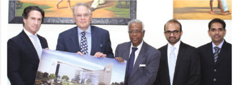
Delegates from Mount Sinai Health Network, Medical School in New York, USA, during their visit to MNR Group for a collaboration tie-up