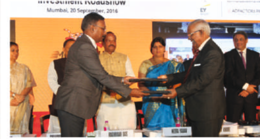
In the presence of Hon'ble Chief Minister, Shri Raghubar Das, an MoU was signed with the Government of Jharkhand to establish institutions in Ranchi